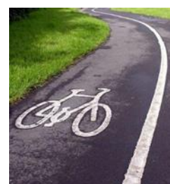
Keep cycle paths free for cyclists