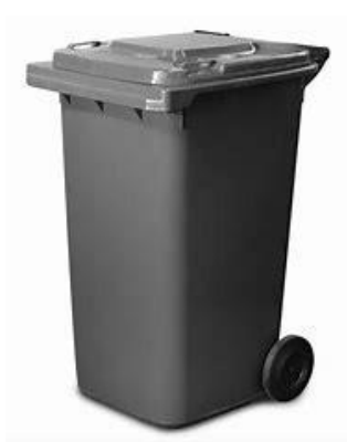
Grey/Black – Household Waste

At your self-catered accommodation, there will be one bin for normal household waste that cannot be recycled and one bin for waste that can be recycled.