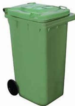
Green – Recycling Only

Glass SHOULD NOT be put in either bin and any glass should be taken to a recycling centre or bottle bank. If you put the wrong items in your bins this could result in them being removed.