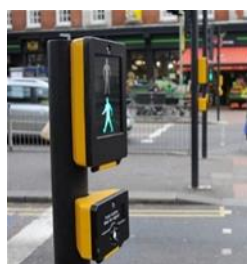
Be safe when crossing roads by using Pelican crossings