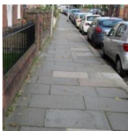
Stay on the pavements and avoid walking on main roads