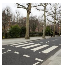
Look both ways when crossing uncontrolled roads