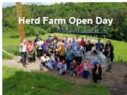
Herd Farm Open Day